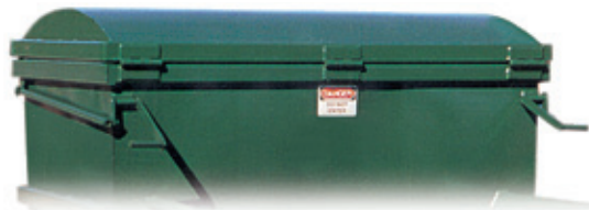
Easy-to-operate latch — saves on time and maintenance.