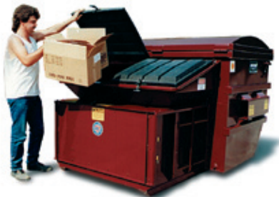
Pak'ntainer with optional hopper and plastic lids to keep contents in, rain out.