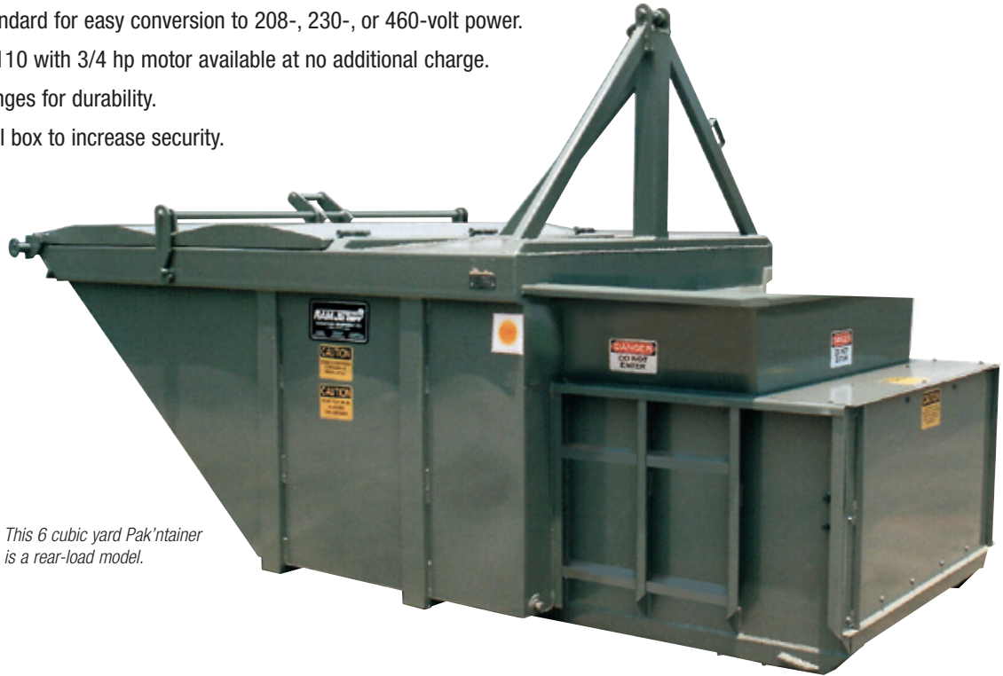
This 6 cubic yard Pak'ntainer is a rear-load model.