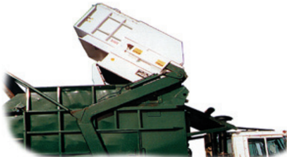
Pak'ntainer is designed for compatibility with a wide variety of collection vehicles.